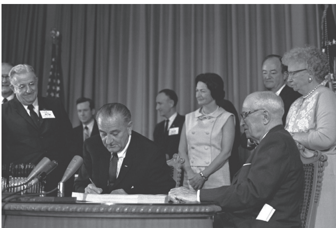
(President Lyndon Johnson signs the Medicare Bill at the Harry S. Truman Library and Museum in Independence, Missouri. Taken July 30, 1965.)